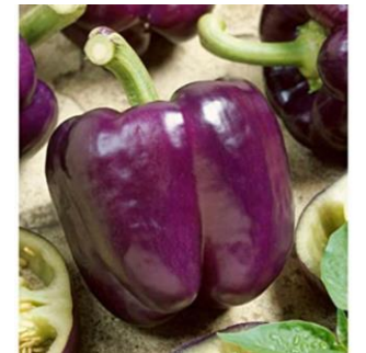
Purple Beauty Sweet

*Limited quantities of all plants, so inclusion on this list is no guarantee of availability*