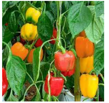
Mini Bell Blend

*Limited quantities of all plants, so inclusion on this list is no guarantee of availability*