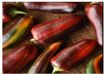
Mocha Swirl Hybrid