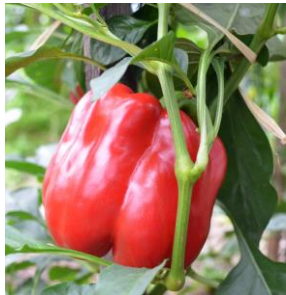
King Arthur Hybrid