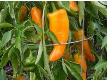
Mama Mia Giallo