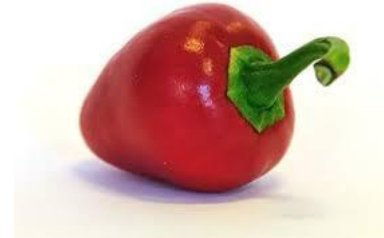
Pimento Elite Hybrid

*Limited quantities of all plants, so inclusion on this list is no guarantee of availability*