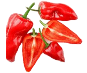
Pizza My Heart