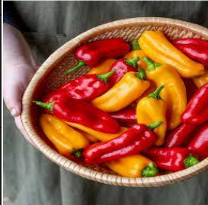
Nibbler Red and Yellow Hybrid