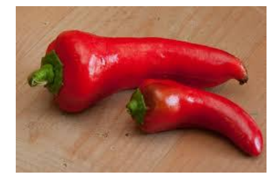
Tolli's Sweet Italian