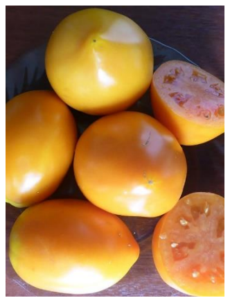
Dwarf Golden Heart