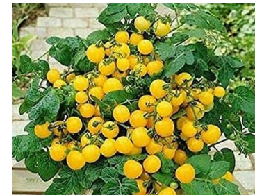
Patio Choice Yellow