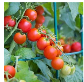
Tumbler Hybrid Bush