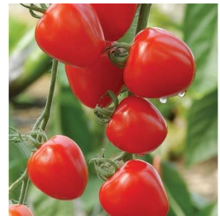
Tomato Berry Garden