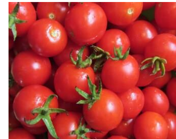
Baxter's Bush Cherry