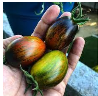
Brad's Atomic Grape