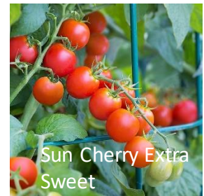
Sun Cherry Extra Sweet