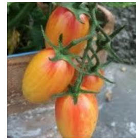
Artisan Blush Tiger